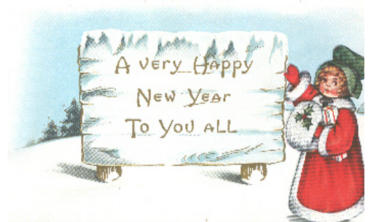
1911 Holiday card; from Museum collection

(THEN PLEASE MAIL ABOVE APPLICATION TO MIRACLE OF AMERICA)