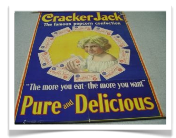
It's hard to show the impact of this nine-foot-tall Cracker Jack poster in a photo. It is scheduled for restoration to its original grandeur.